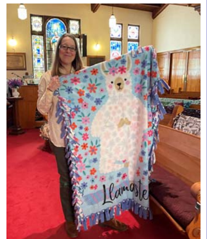
This is what 41 fleece blankets looked like . . . All spread out!