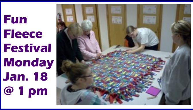
The Sunday school class, under the guid-

pm at the church. We will be making Fleece blankets for the Child Advocacy Center. All are welcome to come and enjoy the fellowship as we work at making the fleece blankets which will provide some comfort to a child who has been a victim of child abuse. Light snacks will be provided. Fleece kits are available at JoAnn's or Wal-Mart. Come . . . spend a couple of hours with us and know that the love with which you made a blanket will provide a child with some warmth and security.